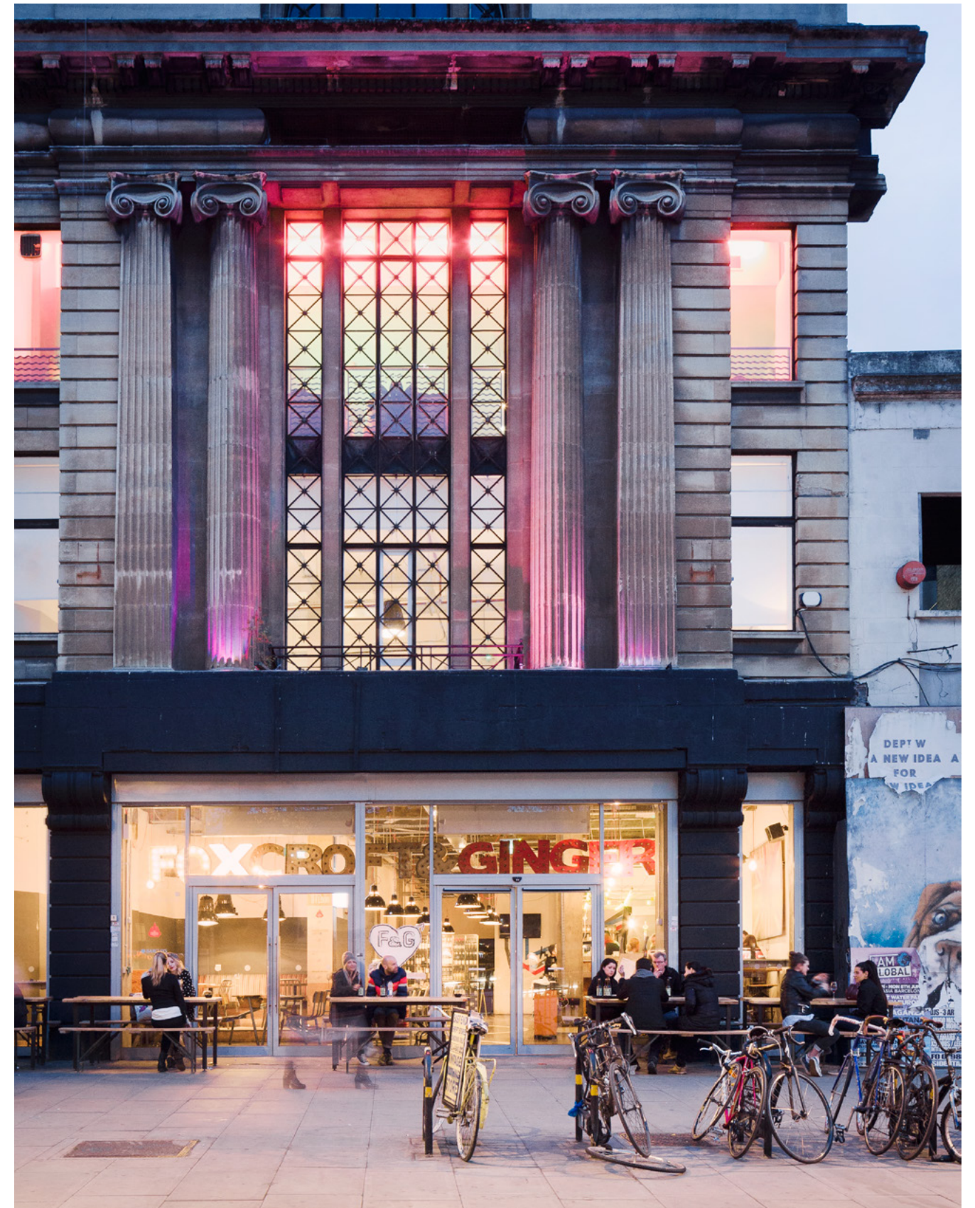
Kano Headquarters Whitechapel, E1 London

With Opendesk you are supporting young designers and local fabricators – resulting in a unique affinity to your workplace through a heightened connection to its design and making.